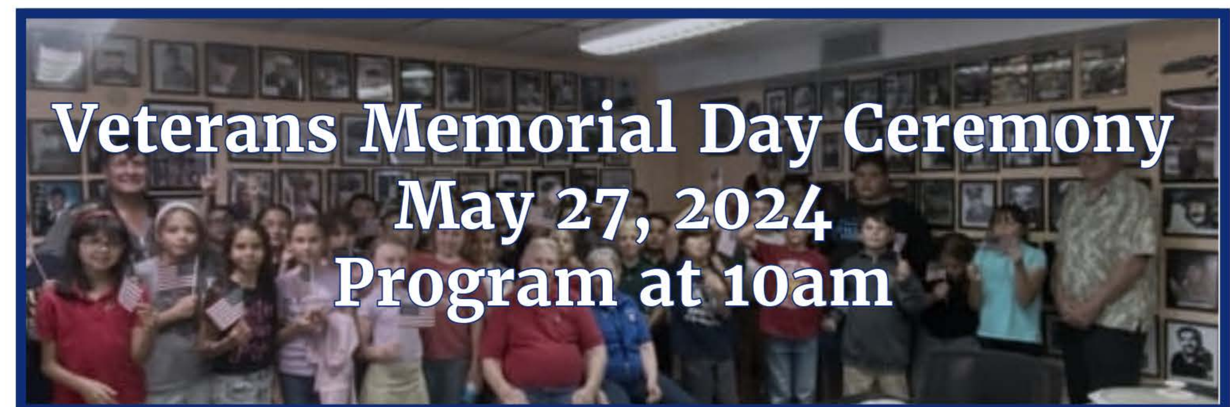
Veterans Memorial Day Ceremony May 27, 2024 Program at 10am